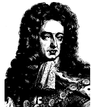
William III of Orange

Before William and his wife Mary could be crowned, they had to agree that Parliament was the lawmaking body in England—not the king. They also had to agree to ask permission from Parliament to gather an army. William and Mary had to accept this and several other acts passed by Parliament that became known as the English Bill of Rights. In this way, some traditional powers of the monarchy were revoked . The Glorious Revolution was a great victory for parliamentary powers.