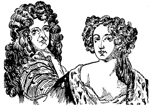
William and Mary

Finally, Parliament did two more things. First, it passed a law called the Toleration Act. The Toleration Act gave religious freedom and limited toleration to Puritans, Quakers, and other Protestants, but not to Catholics and Jews. It was an attempt to create an atmosphere of tolerance . Second, Parliament passed the Act of Settlement. This law said that Catholics could never become kings or queens of England. The English remembered their troubles from the Catholic Stuart kings and did not want to repeat them. So, during the 17 th and 18 th centuries, England passed from a government with an all-powerful king, also known as an absolute monarchy, to a government with a king who shared his powers with Parliament, known as a limited monarchy. Yet England continued to expand its empire and kept its position as a very strong world power.